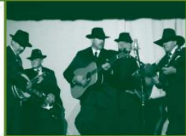
Saturday, July 12, 2014 7:00 p.m. to 8:30 p.m. DARK HOLLOW BLUEGRASS BAND

City Park Bandshell ★ 7:00 p.m. to 8:30 p.m. ★ Free of Charge