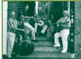
Saturday, July 19, 2014 7:00 p.m. to 8:30 p.m. ANNAPOLIS BLUEGRASS COALITION